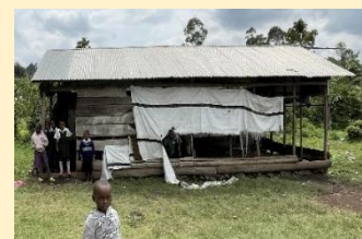
Lessons in the board shack

At St. Mary's School, children from two classes are currently still being taught in a board shed. When it rains, they seek shelter in the church. A new building is planned so that regular classes can be held in the future.