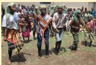
Dance at the orphans meeting

Before Christmas, a small amount of money is paid to the families of the sponsored children , which they can use to buy clothing and food as needed.