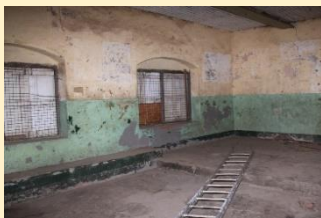
Four classrooms are in urgent in need of renovation

At St. Mary's School, children from two classes are currently still being taught in a board shed. When it rains, they seek shelter in the church. A new building is planned so that regular classes can be held in the future.