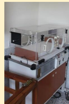
The first incubator

In emergency situations, we provided individual assistance as usual. For example, we covered the cost of treating children and relatives, and this year we built two new houses for families whose homes were in danger of collapsing.