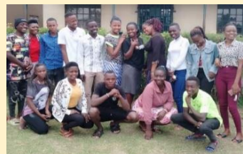
Our older godchildren in the training center in Kabale

and other aspects of daily life, and are also allowed to simply be children, enjoy their free time, read a book or play with a ball and rope.