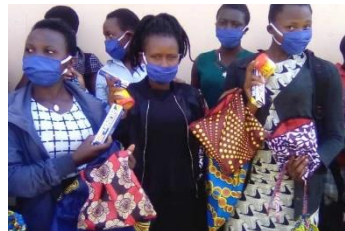
Distribution of aid packages

In order to support the families of our 150 sponsored children and to help another 200 Aids orphans in Kisoro region, we organised four issues of aid packages with food, hygiene articles (soap and detergent) as well as everyday face masks between the end of May and the end of November. One time there were also clothes and a non-fiction book for our younger sponsored children (up to seventh grade). The older sponsored children were paid a pocket money that they could dispose of themselves. In coordination with our local partners, a small amount of money will also be paid to the families of the sponsored children before Christmas from which they can buy clothes and food, depending on their individual situation, or make much-needed repairs at their cabins. We financed this aid from the school fees that did not have to be paid in full for 2020, as well as from free donation.