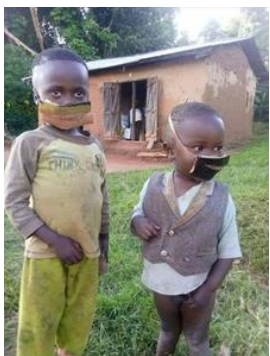
Children in the villages

Since October, the international airport has finally been open again, so that business and tourist trips are possible under strict conditions. Free travelling like we practised it in the course of our work during the last couple of years is still not possible.