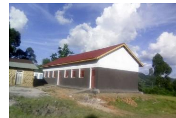
New rooms at Kagera Primary School

Already before the lockdown, the construction of two classrooms at Kagera Primary School and the construction of two water tanks at schools were completed. The examination classes are currently testing the new premises before the other students will also benefit from the new classrooms and the water tanks in January.