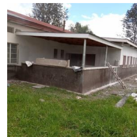
Laboratory from the outside

St. Francis Hospital in Mutolere is the only clinic in the district where Corona patients can be treated according to WHO guidelines.